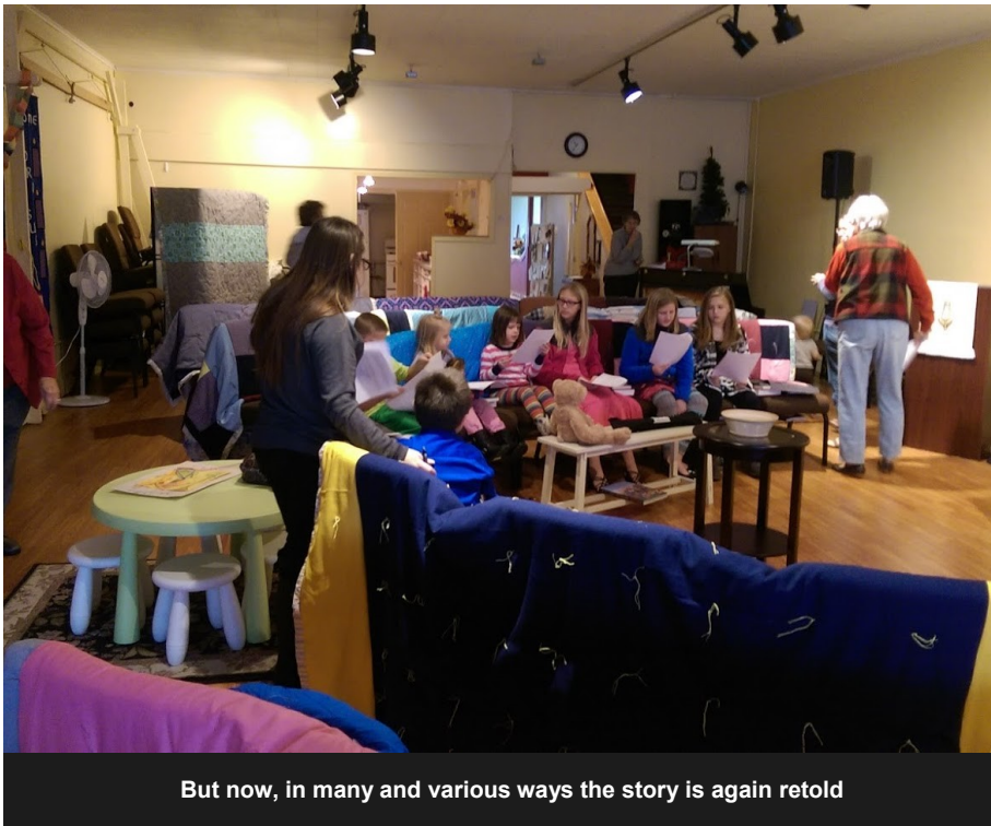
But now, in many and various ways the story is again retold